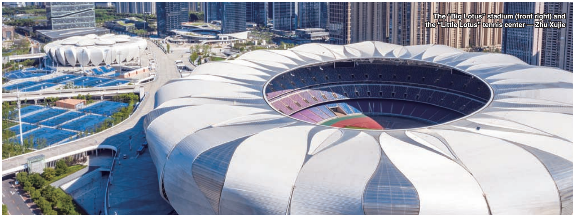
The "Big Lotus" stadium (front right) and the "Little Lotus" tennis center — Zhu Xujie